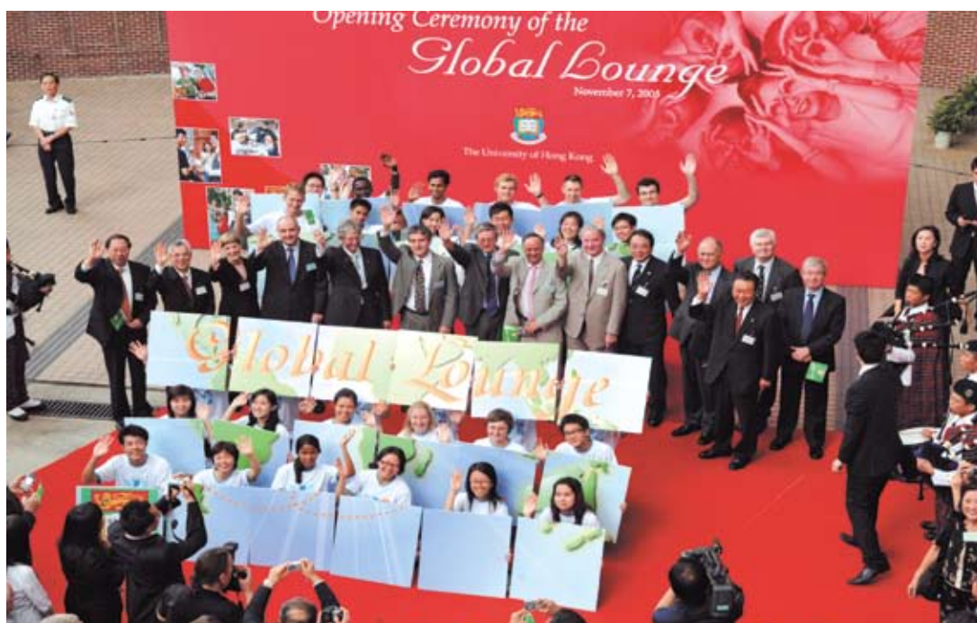
Heads of the world's leading universities and Consuls General celebrated HKU's internationalisation at the recent opening of the Global Lounge, an international centre for students. There are now over 3,000 international students on campus who come from more than 50 countries around the world.