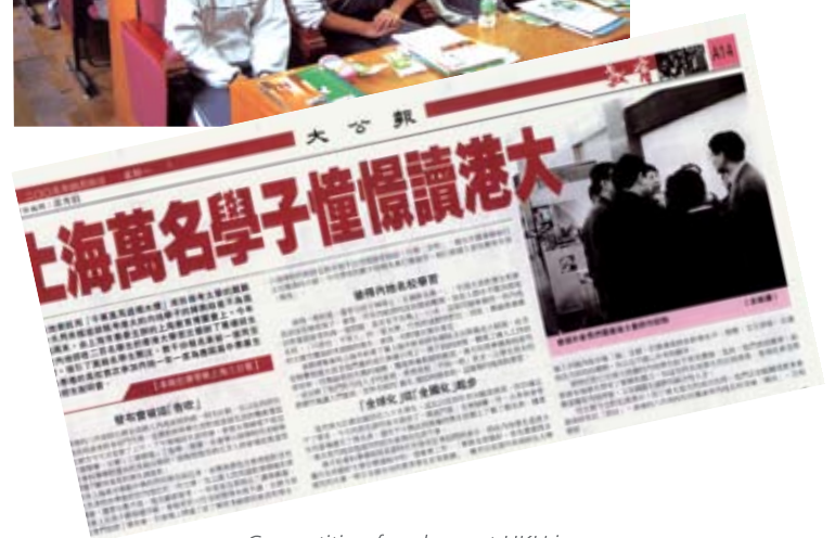
Competition for places at HKU is fierce. More than 4,800 top students from the Mainland scrambled for 250 fee-paying places this year.