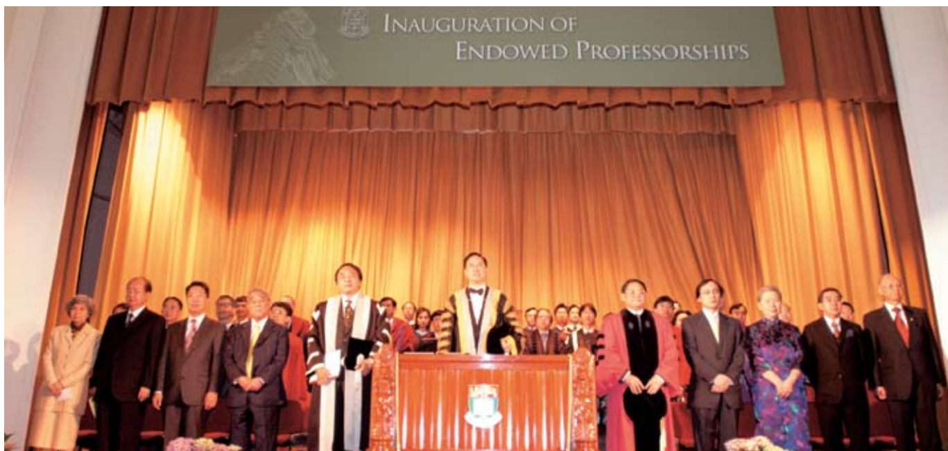
The Endowed Professorships Scheme upholds a proud tradition of excellence, with perpetual endowments in support of teaching and research in designated disciplines. It is also an act of community endorsement.