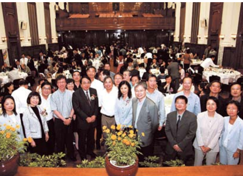
Starting with the Class of 1971, the Silver Jubilee Class Celebrations have established a remarkable Alumni Giving tradition.