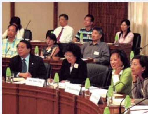
At a Convocation forum

academic institutions which demonstrate the ability to contribute to finding solutions for the pressing issues facing humanity, namely global poverty, natural resources management, sustainable development, peace and conflict. We have Harvard, LSE, Columbia and many others all engaging in conversation on headline issues. HKU’s aspiration is to be a world-class university, not world-class technical institute.”