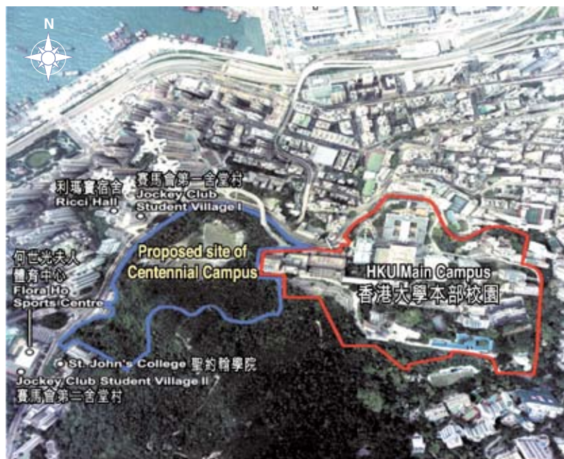
The University will develop its physical campus westward with a 30% increase in size.

Master planning concepts and design models are being developed for the Centennial Campus and should be available in early 2006. We hope that these will inspire the University Family and help us raise supporting funds from the Government