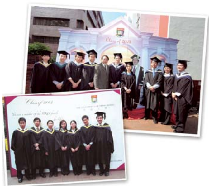
Some of HKU's newest graduates take up the spirit of early giving by setting up graduating class funds. The participation rate of the class of 2003 and 2004 was 5% and 20% respectively.

This exceptional gift is the toughest challenge ever to be put to our alumni. To achieve the maximum match of $500 million, we need 50,000 alumni to each donate $10,000. Alternatively, it means 50,000 alumni each giving $2,000 a year for five consecutive years.