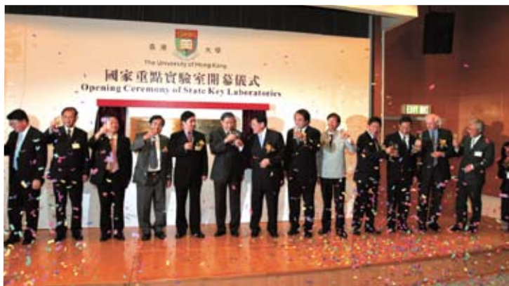
Opening ceremony of two State Key Laboratories: "Emerging Infectious Diseases" and "Brain and Cognitive Sciences" - each is first of its kind outside the Mainland.