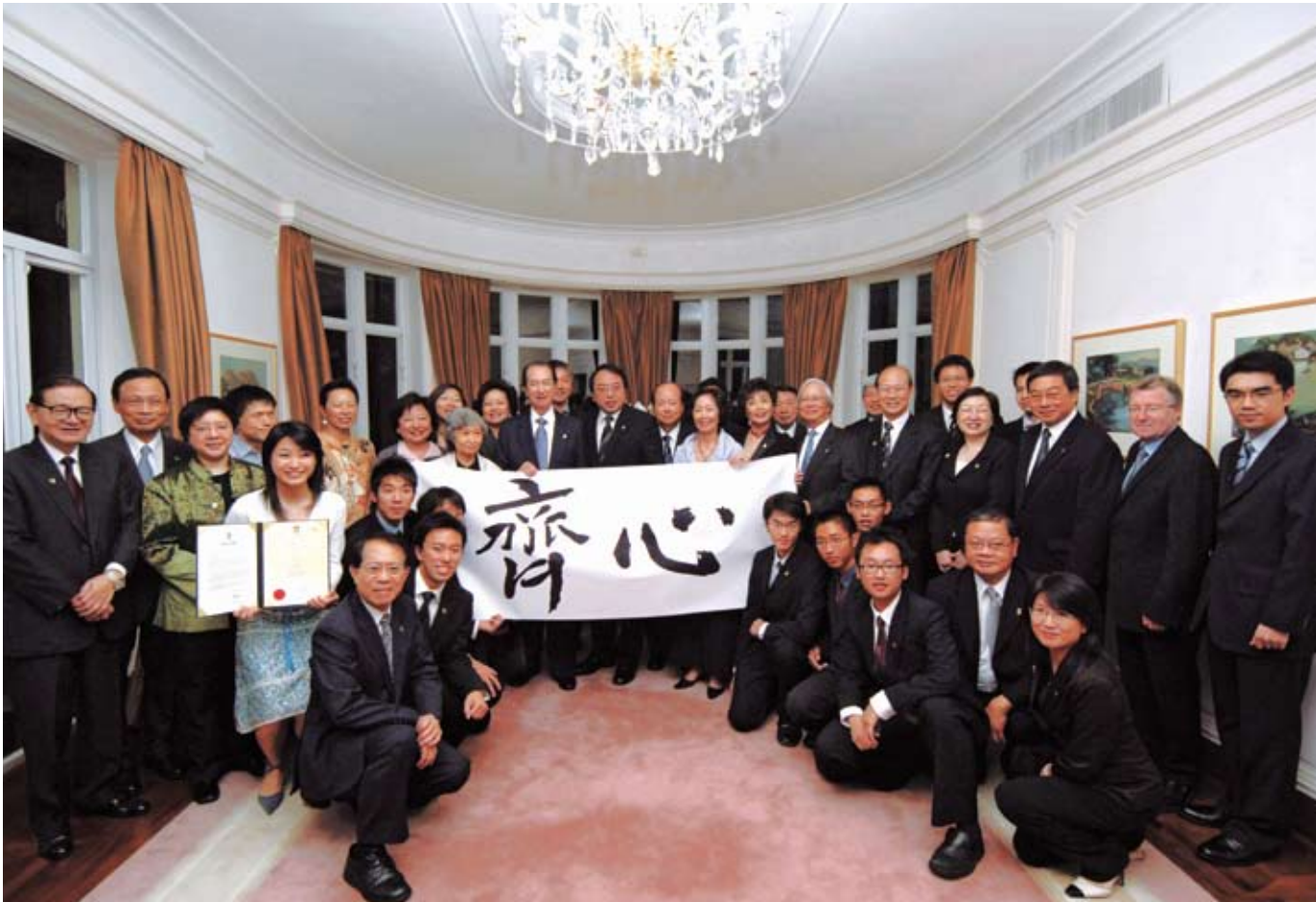
"One Heart, One Family" - alumni representatives of various classes came forth to pledge their support at the launch of the Challenge.