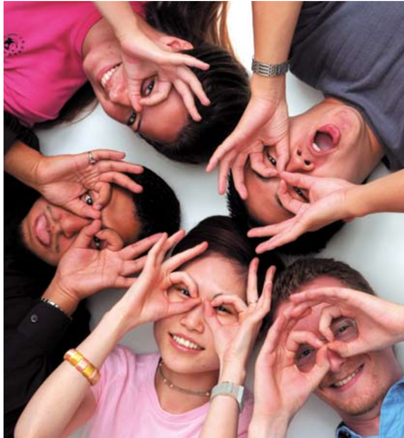
HKU has a target of 20% international students in its undergraduate population within a decade.

The substance of the Vision was first released to a group of alumni leaders in July 2005. Subsequently, a series of management-sharing sessions have been arranged on campus, and will continue until February 2006. We have always regarded our collegial and participatory management style as something dear to HKU and with wider debate, discussion and input from the University Family, we hope that the Vision will